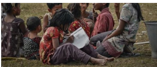
Rights of Children under the Indian Constitution