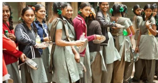
India's long road to E-learning