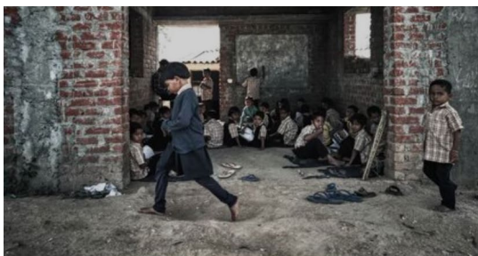
Malnutrition faced by Marginalized Children during the Pandemic

It was a useful and informative experience for interns. They expressed their willingness to work with Sunshine in future as well. We have also received requests from other students to do internships with Sunshine.